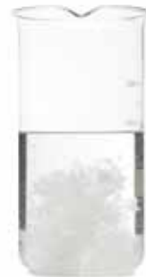
Aqua Soft toilet paper